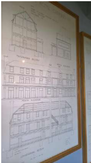
Francis Mew drawings on display in the Woodvale

Apart from the white box like 1 st floor extension the Woodvale has remained relatively unchanged externally since the 1930s.