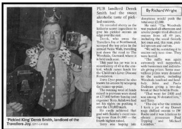
Another great charitable event the Annual Pickle War has raised over £30,000 for charity.