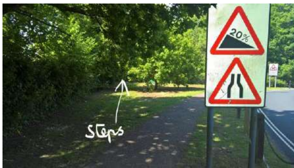
Steps and path down to the shore through the old clay pit