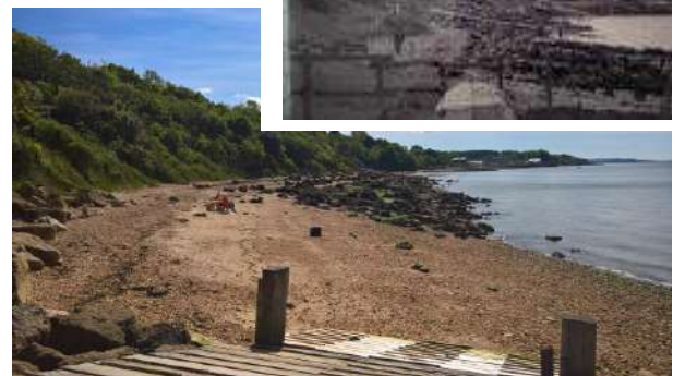
The rocky centre ground marks the site of the old coastguard boathouse

The main beach area, off the green and at the bottom of Shore Road, was, in its day, in the 60s, 70s and early 80s, a beach with a putting green, diving raft and paddle rafts that you could hire. Gurnard Sailing Club founded in 1931 as a working man's dinghy club, and has hosted Cowes Dinghy Week and several national championships. In 1996, the club was rebuilt with a Lottery grant, but it remains a self-help club offering high quality dinghy racing and is recognised for its long-standing contribution to the community.