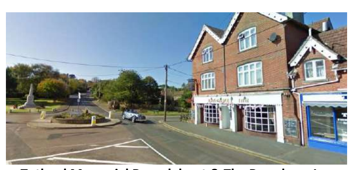
Totland Memorial Roundabout & The Broadway Inn